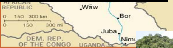
Ellen arriving in 2006