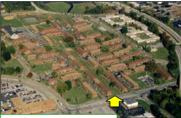
College Hill Courts ("Westside"-see p. 3)