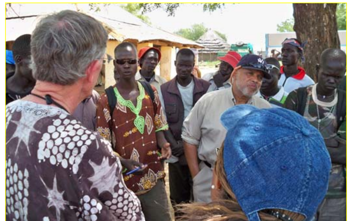
Left is one evangelism team going from shop-to-shop with the Gospel. Two are Westminster Bible College grads. Right is debriefing after 2+ hours of evangelization. At least one professed Christ. We particularly wanted to share the offer of the certainty of salvation with Muslims. We found them willing to listen to our personal experience of salvation and to the Gospel, as long as we desired, and we tried to answer their questions. They would not pray with us, but were generally very cordial.