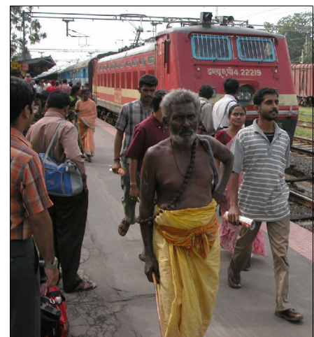
Hindu priest collecting alms for a safe journey