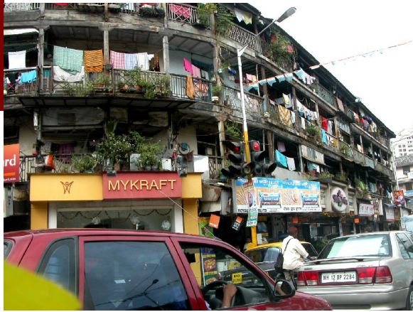
Mumbai (Bombay) apartments

Quick Facts (2005): Population: 1 billion, 97 million Hindus: 74%, Muslims: 12%, Christians: 6%, Sikhs: 2% 42.5% of India is unevangelized (World A) = 466.4 million; By 2025 a projected 39.1% will still be unevangelized 454 People Groups in India Adult literacy is 52%; Life expectancy is 65; Pray for Indians Source: World Christian Database www.worldchristiandatabase.org