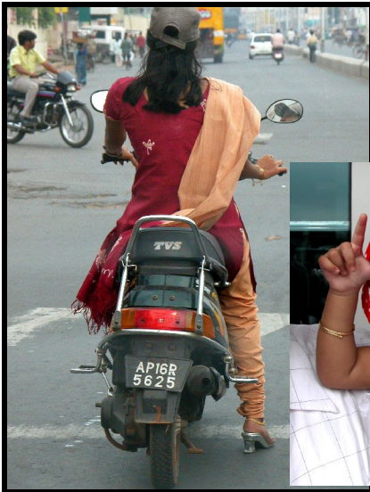
Ladies of India