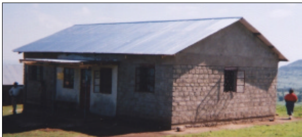
Remote Clinic near Kapchorwa

Highpoint? "The opportunity to talk about God to a receptive and 'hungry' audience—that was also the lowpoint—that they were so hungry and the time was so short, plus the sick babies broke my heart."