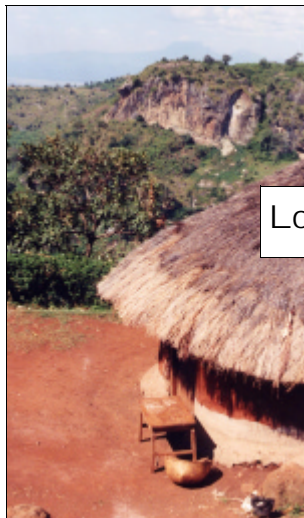
Looking off Mt. E Igon, NE Uganda