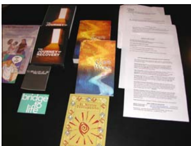
From left, children's materials, "Journey of Recovery" NT & DVD for addictions; tracts, NIV Bible and NT, Spanish NT, discipleship handouts, job program information and websites.