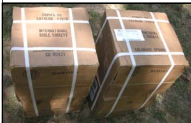
Donations have provided for over $3,200 worth of evangelistic materials since late 1999.