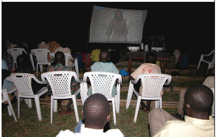
Villagers would come down the hill to see films, such as the "Jesus" film. RMNI provided a laptop and video projector for this ongoing ministry.

Nov. 5-18 Cost: $2500. Workers are needed to minister in medical clinics (no previous training required, but medical training would be great). We also need teachers and evangelists. Needs in Haiti are urgent and deep, with few teams coming. This is a demanding trip. Pray about it, please, and if led, send in the application found at www.RMNI.org/shortterm/Haiti.asp