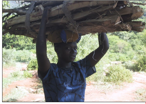
Top left: Lopit funeral lasting 2+ days—God's grace is evident in Lopit culture's wise social structure. For example, after 20 years the leaders pass down their authority and then advise. Center left: school under a tree; Center right: upper level classroom; Bottom right: women carry the firewood; Bottom left: the village militia protects from raiders.