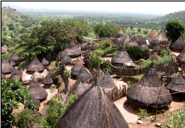
Lopit tribe, Lohutok, Sudan