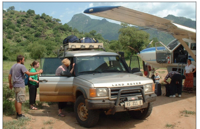
Arrival by AIM Air, & transportation by resident missionaries