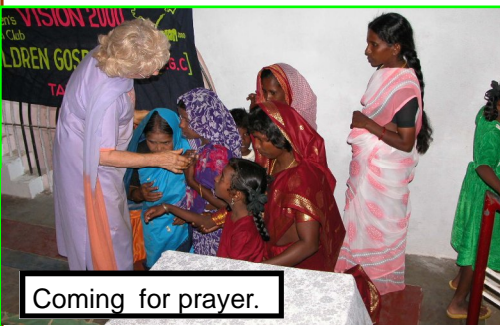
Coming for prayer.

This Indian pastor has planted 27 churches and currently pastors two. He testifies that neither persecution nor lack of funds trouble him anymore. The RSS—a right-wing Hindu organization aiming at Hinduizing and militarizing India—frequently opposes Christian work. Pastors told me that children are unable to obtain college scholarships and families unable to obtain low-income housing from the government, because they are Christian.