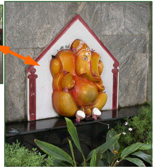
Above are coconut & incense offerings to Ganesh (god of luck and prosperity), at a gas station! Below is a town temple and at bottom, a village temple.