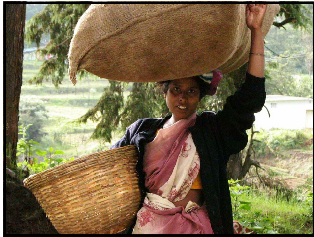
Lady with tea, Nilgrs, India