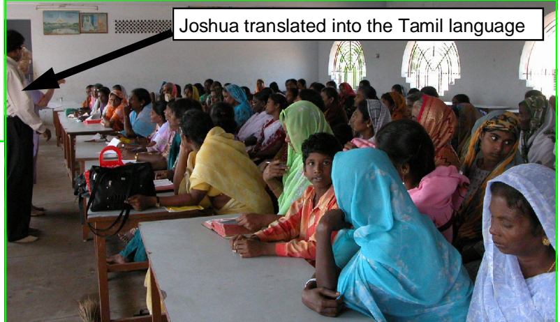
Joshua translated into the Tamil language

Flo Samuels taught a total of about 350 very appreciative ladies at our 6 venues. Most were wives of pastors, and were noticeably joyful when Flo was through. Topics included the "Mature Godly Woman," personal evangelism, in which Flo is gifted, and prayer.