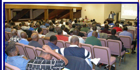
110 of these men attended Jim's Cedine workshop "Failing to Fail."