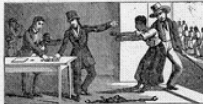
Selling a mother from her child