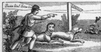
Northern states returning fugitives