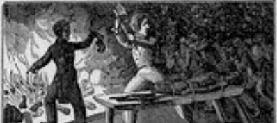
Cutting up a slave in Kentucky

Whites think racial relations are getting better all the time, and take their SUV's into the passing lane. But seventy-four percent of black adults and 62% of black teens think racial relations are getting worse 1 and that they can't accelerate into the passing lane to get