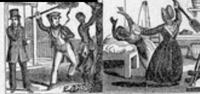
Slavery "improving" female life